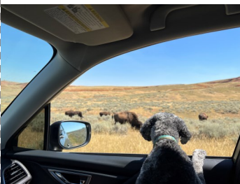
Zoey checking out the bison on a road trip to Yellowstone.

8. We love traveling by car. We have been to a lot our national parks and monuments. Sadly, these special places are being loved to death and have enacted a Timed Entry Permit System. These permits are first come, first served and are released a month in advance. To save money, we purchase a National Parks Pass that is good for a year. For anyone 62 years or older, the person can purchase the pass for $80.00. This is good for the person's lifetime, or they can get a yearly pass for $20.00. Know the rules of the road. Be mindful that when you travel across state lines, you are expected to adhere to their laws. Regardless of what state you are from.