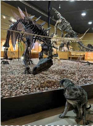
Checking out fossils in Wyoming

Become a member of your preferred hotel chain and stick with them. The more you stay the more you get. Marriott Bonvoy has some decent perks once you hit the gold status. Hilton Honors Gold status tends to give you more than Marriott. Regarding both statuses... it is rare that you will get a room upgrade without asking for it.