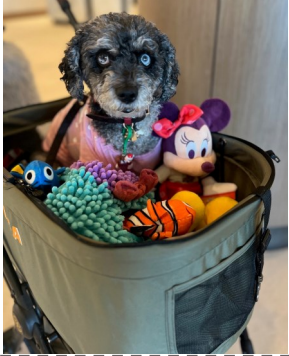
Zoey recovering from a day at Disney.

1. Traveling with a pet. Zoey is sweet, kind, and loves to cuddle. She is also growing older.