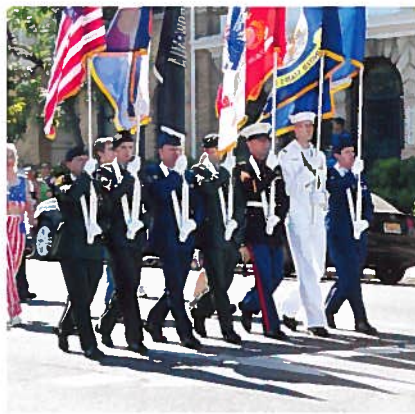
The American Veterans for Equal Rights, Rocky Mountain Chapter, sponsors the Colorado LGBT Community Color Guard, the nation's first and only regulation LGBT color guard. Active, reserve, and veteran members of the Army, Navy, Marine Corps, and Air Force make up the guard.