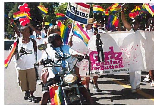
Girlz Pushing the Button (shown in 2012) mobilizes Colorado's African American lesbian community.

1996. The next year se and informatio vendors. Entertai hours and feature it co-manager, tol PrideFest was organi ould support such re considered big each year the even isexual Communit st important part coming together pride is great." Th executive director l the highest-rank uring Clinton's fir