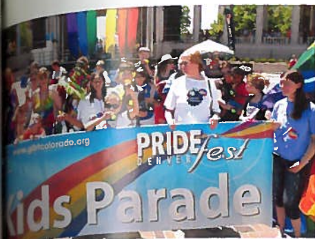
Saturday of PrideFest weekend (shown in 2011) is family field day—with sack and relay races, water balloons, Kiddie Karaoke, and the world-famous Dogs in Drag contest.

lown. Despite the stream with the pu vest Banks, Targe ry. Organizers use rowing acceptance arry Gross, autho Aen and the Med ainstream came on administratio ie control. Also or Wellington We for gay and lesbia nt 2. The future o t the table, but m u are going to hel