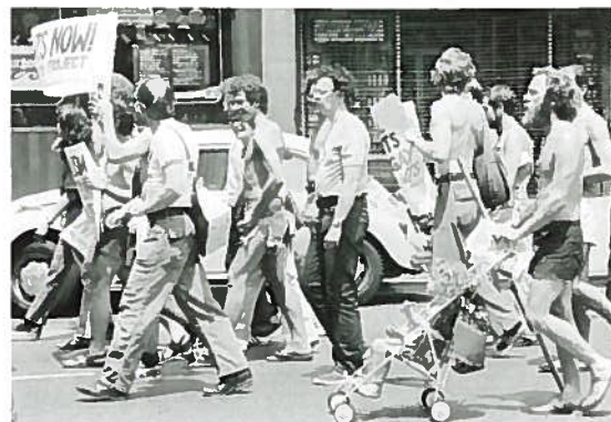
Gay rights activists demonstrate at the Democratic National Convention, New York City, 1976.