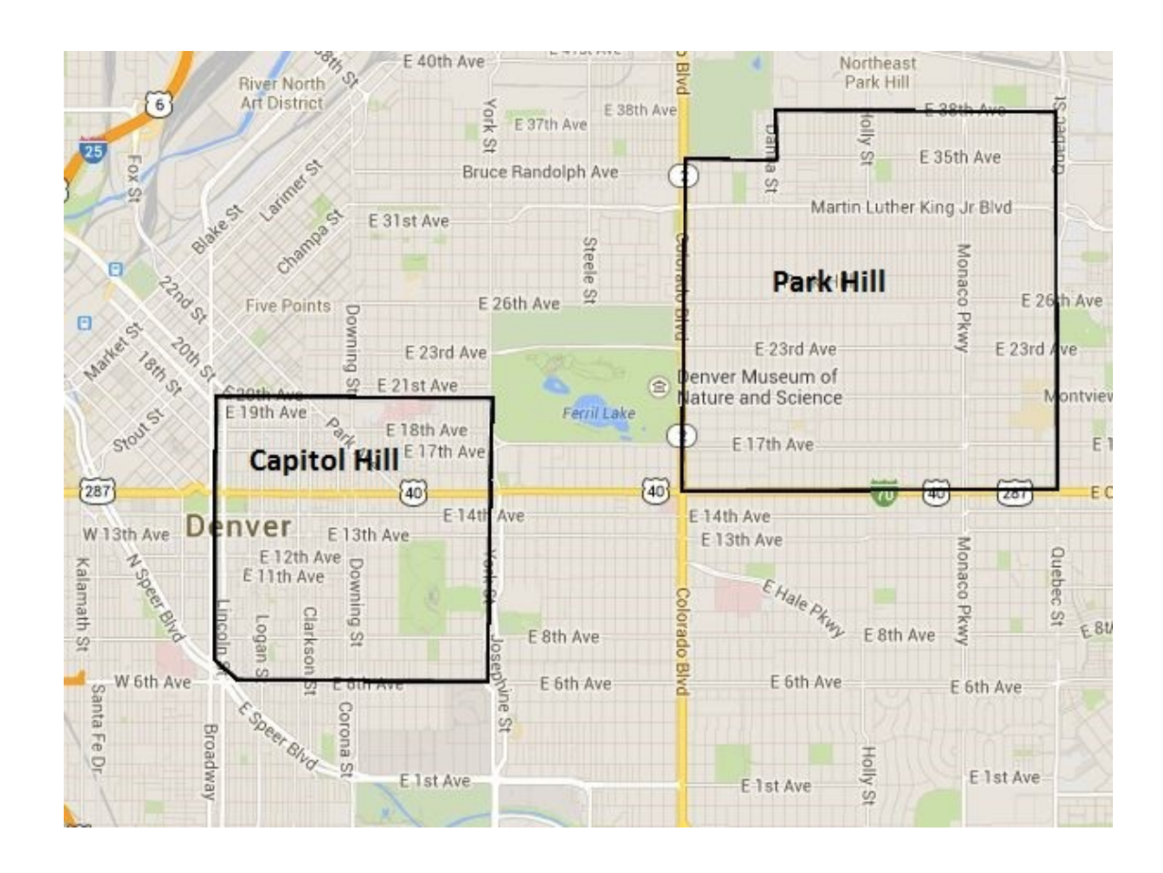
Figure 1. Map of east-central Denver indicating the neighborhood boundaries of Capitol Hill and Park Hill.