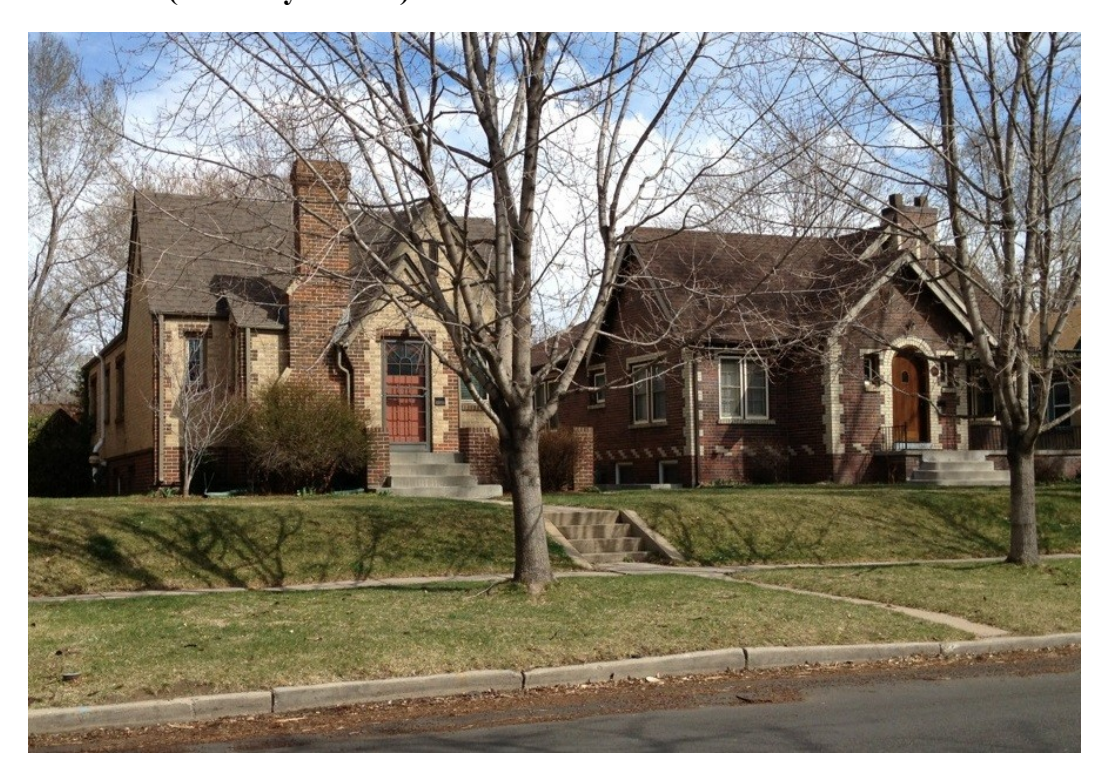
Figure 4. Streetscape of single-family homes built in the 1920s and 1930s, located on the 2000 block of Kearney Street in Park Hill. These houses are located five blocks north of the house in Figure 3.