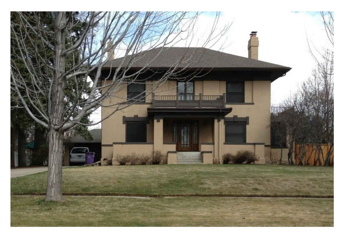
Figure 3. A single-family home on the 1500 block of Kearney Street in southernmost Park Hill.