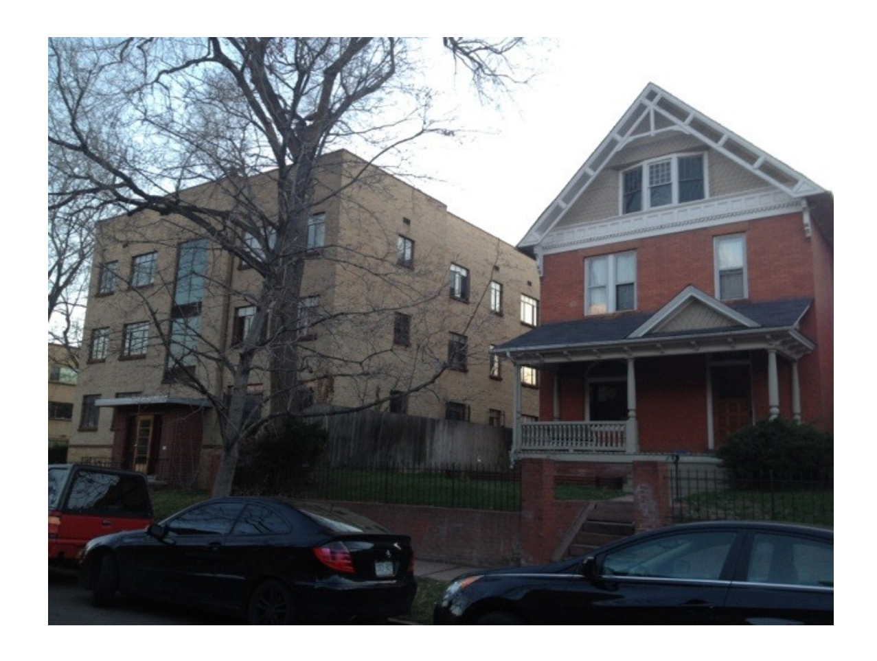
Figure 7. Streetscape of multi-family housing on the 1200 block of Emerson Street in Capitol Hill. The building to the left is an apartment building constructed in the late 1940s, and the building on the right is a single-family home from the 1890s that was later converted into apartments.