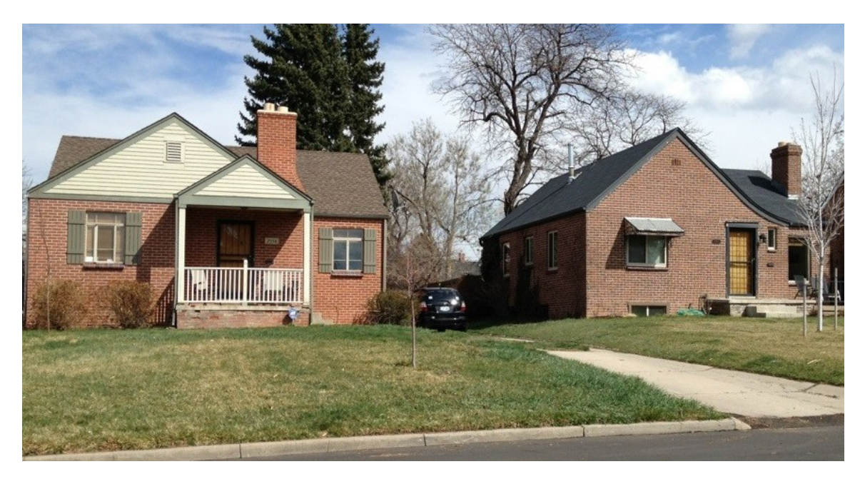
Figure 5. Streetscape of single-family homes built in the 1930s and 1940s on the 2500 block of Kearney Street in northern Park Hill. These houses are located five blocks north of the houses in Figure 4.