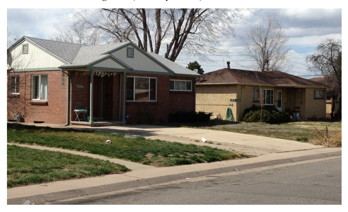
Figure 6. Streetscape of post-World War II single-family homes on the 3500 block of Glencoe Street in northeastern Park Hill. These houses are located ten blocks north of the houses in Figure 5.